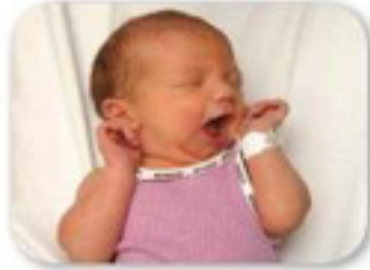
• Mouth opening