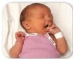
• Hand to mouth