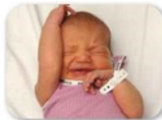
• Agitated body movements