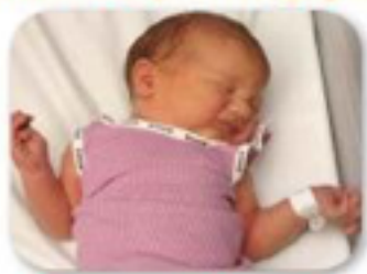
• Increasing physical movement