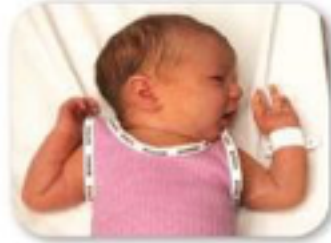
• Turning head • Seeking/rooting