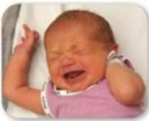
• Color turning red